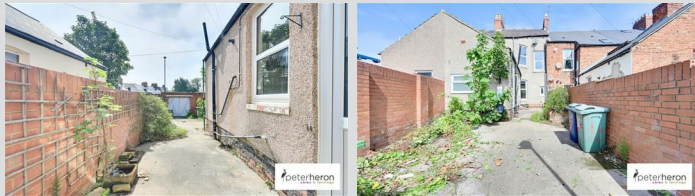
Town garden to the front. Low maintenance courtyard to the rear with shutter door providing off street parking.